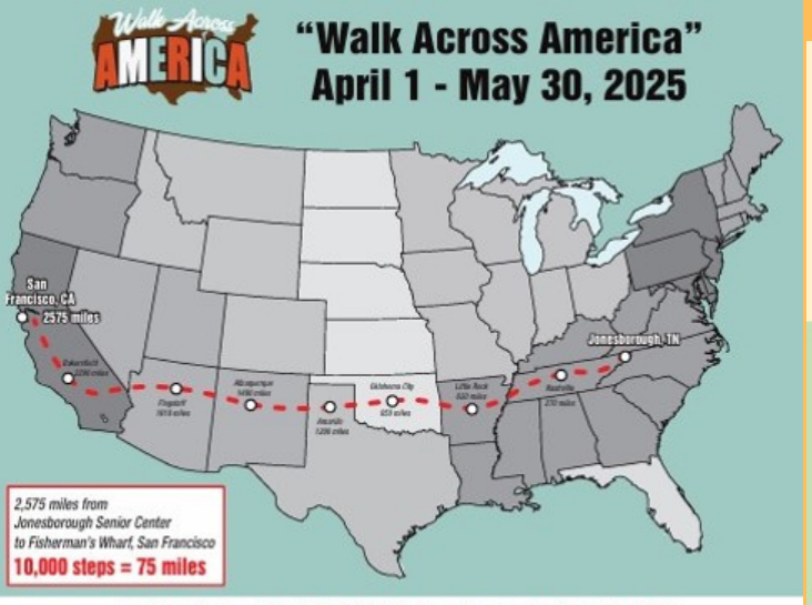
1,211 miles = 161,467 TOTAL steps to reach Amarillo, TX